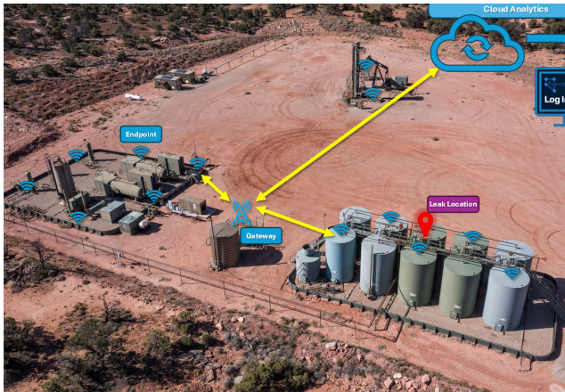
Modular MethaneTrack™ components enable custom site configuration

MethaneTrack™ is your ideal solution for close proximity continuous monitoring in hazardous environments.